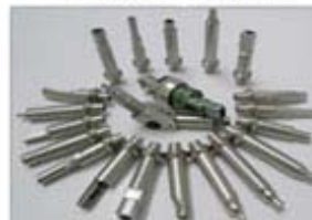
27 assorted tips available