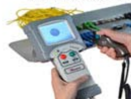
SC-APC Female test