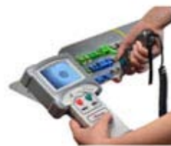
60 Angle to test