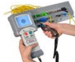
LC-APC Female test